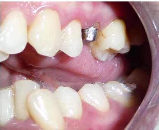
Fig. 9. Image after applying the DCR on 25

The next stage essentially prosthetic consists of fingerprinting the prosthetic field. As denture coverage there was opted for a unidentare metal-ceramic prosthesis totally physiognomycal. Clinical protocol and this case included the stage of occlusion rebalancing.