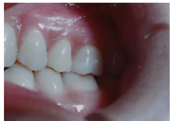
Fig.7 Overview after coronary reconstruction and occlusion equilibration

Another version of coronal reconstruction is the one in which the treatment is essentially