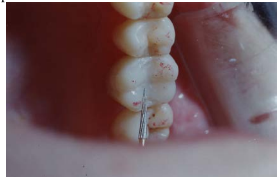
Fig. 6. Occlusion equilibration

The association with occlusion rebalancing is mandatory knowing that any changes in occlusal relief may allow the occurrence of premature contacts and occlusal interferences.