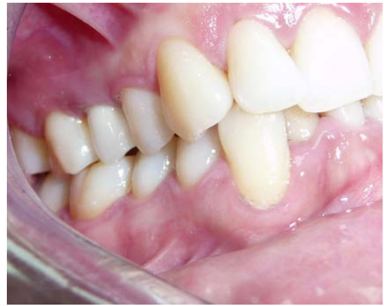
Fig. 10. Final clinical aspect-right hemiarcade

The next stage essentially prosthetic consists of fingerprinting the prosthetic field. As denture coverage there was opted for a unidentare metal-ceramic prosthesis totally physiognomycal. Clinical protocol and this case included the stage of occlusion rebalancing.