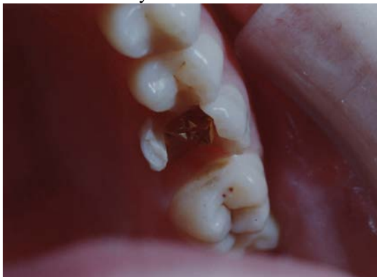
Fig. 4. Application of the prefabricated pins at root canals level

After root canal preparation it followed the screwing and in the same time the cementation with phosphate cement of prefabricated pins. We mention that the choice of these is made after a preliminary determination of root diameter sanctuary.