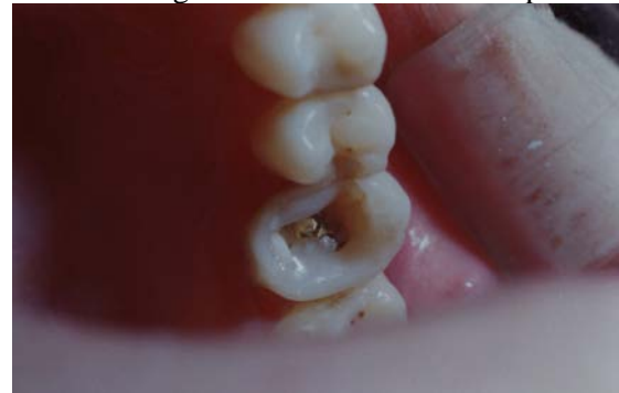
Fig. 5. Coronal reconstruction through addition method

The next step involves coronal reconstitution using composite. Its use is made after aesthetic evaluation, while respecting the characteristic morphology of maxillary second molar. Application of the composite material is made in layers by addition method, very important being the polymerization after each applied layer. This curing is made in different angles, so that the curing is made in surface and depth.