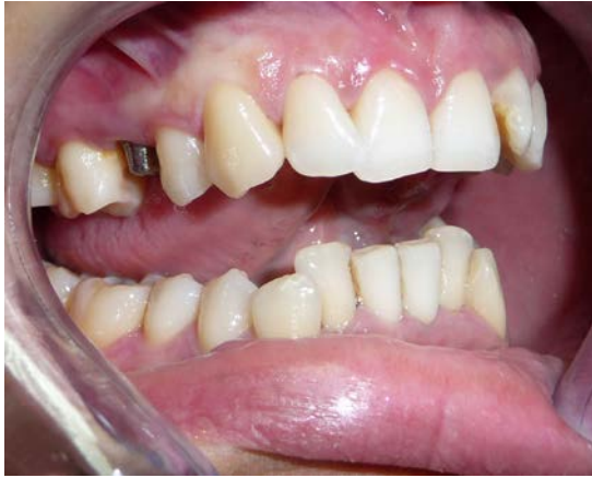
Fig. 8. Image after applying the crown-root device on 15

prosthetic. Below we present the clinical case of a patient who presents large coronary destructions at level of 15 and 25. The treatment follows the same logic as the previous regarding the execution of a root sanctuary. The option for the prosthetic treatment imposes the execution of devices crown-root, adapting and cementing them.