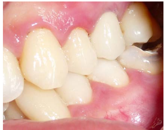
Fig. 11. Final clinical aspect-left hemiarcade