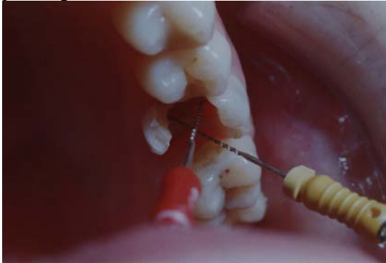
Fig. 2. Root canal instrumentation by permeability using Kerr needles

Permeability of root canal is performed with Kerr needles of various sizes. Kerr needles are used progressive without penetrate too far and to not create false ways. The use in the next step of the Beuttelrock drills should be carefully done; very important in this stage is keeping apical tightness.