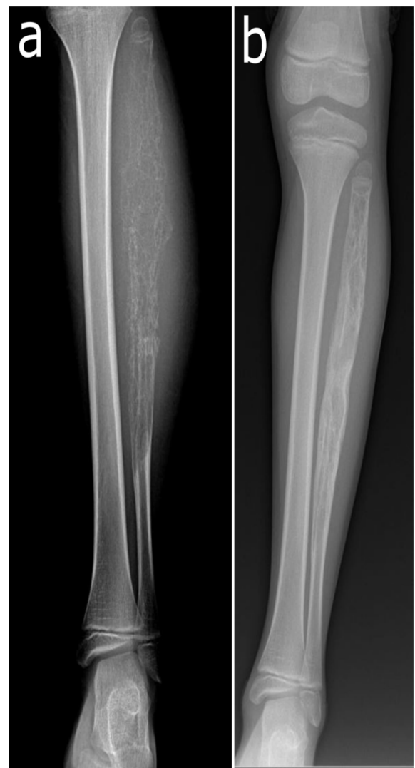
Figure 3. X-ray of the left fibula at presentation (a) and the end of the chemotherapeutic treatment (b).