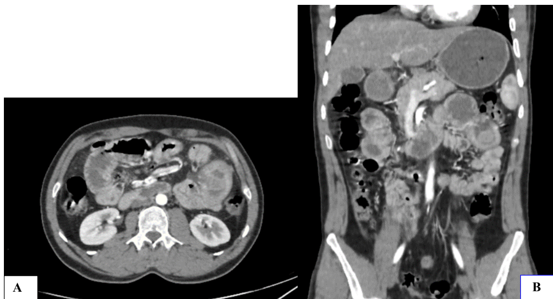
Figure 2. CT scan of the abdomen and pelvis with iodine contrast media injection; A: transverse section; B: coronal section: intramural thickening takes iodine contrast media, homogeneously, in favor of no sign of intestinal wall necrosis.